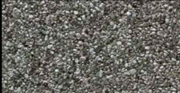
GREY BLEND ●