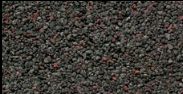
SLATETONE GREY ●