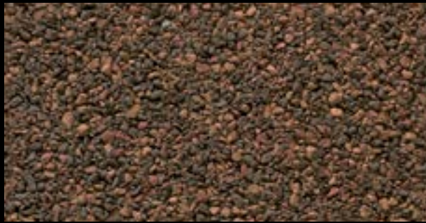
TWEED BLEND ●◆