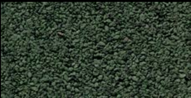
EMPIRE GREEN BLEND ●