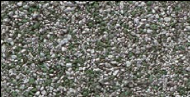
PASTEL GREEN ●