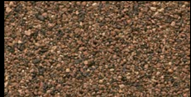
RUSTIC CEDAR ●◆