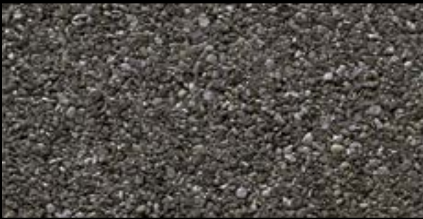
ANTIQUÉ SLATE ●◆