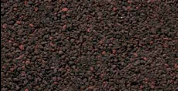
RUSTIC REDWOOD ●◆