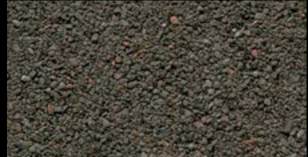
WEATHERED WOOD ●◆