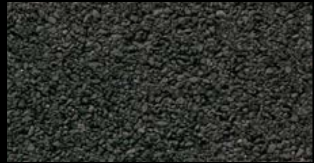
RUSTIC BLACK ●◆