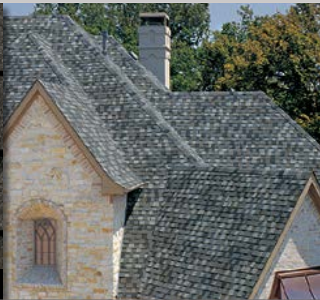
THUNDERSTORM GREY | AMERICA'S NATURAL COLORS