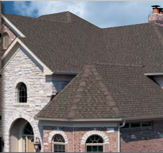
NATURAL TIMBER | AMERICA'S NATURAL COLORS