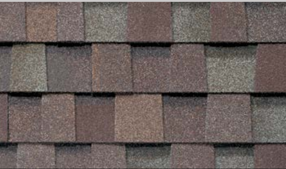
MOUNTAIN SLATE | AMERICA'S NATURAL COLORS