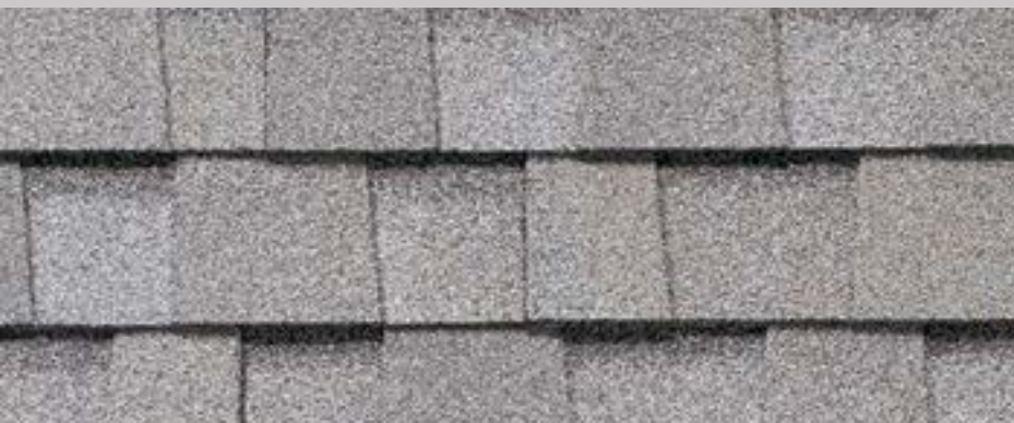
OLDE ENGLISH PEWTER | CLASSIC HERITAGE COLORS