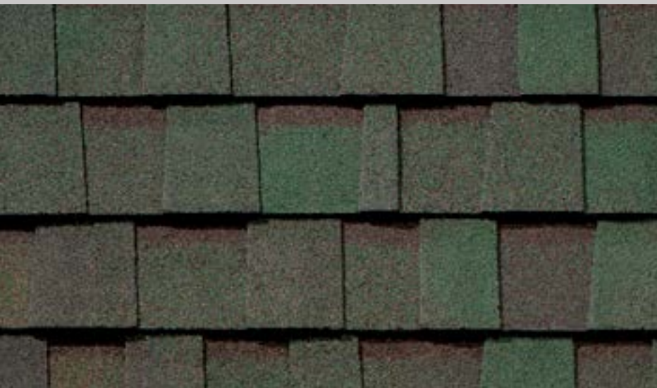
FOREST GREEN | AMERICA'S NATURAL COLORS