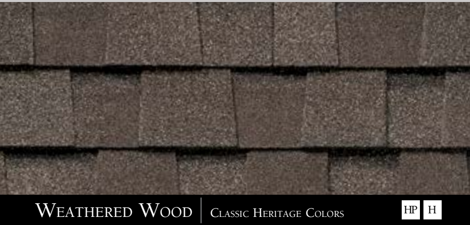
WEATHERED WOOD | CLASSIC HERITAGE COLORS