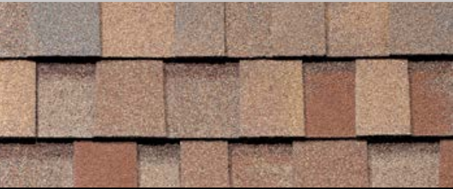
PAINTED DESERT | AMERICA'S NATURAL COLORS