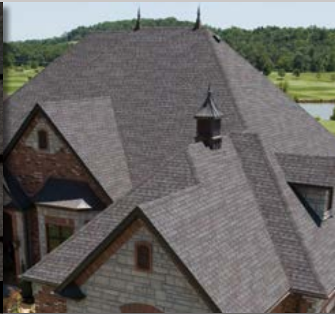
BLACK WALNUT | AMERICA'S NATURAL COLORS