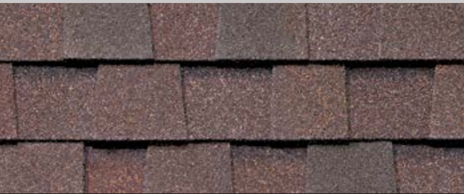
RUSTIC SLATE | CLASSIC HERITAGE COLORS