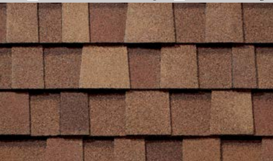
HARVEST GOLD | AMERICA'S NATURAL COLORS®