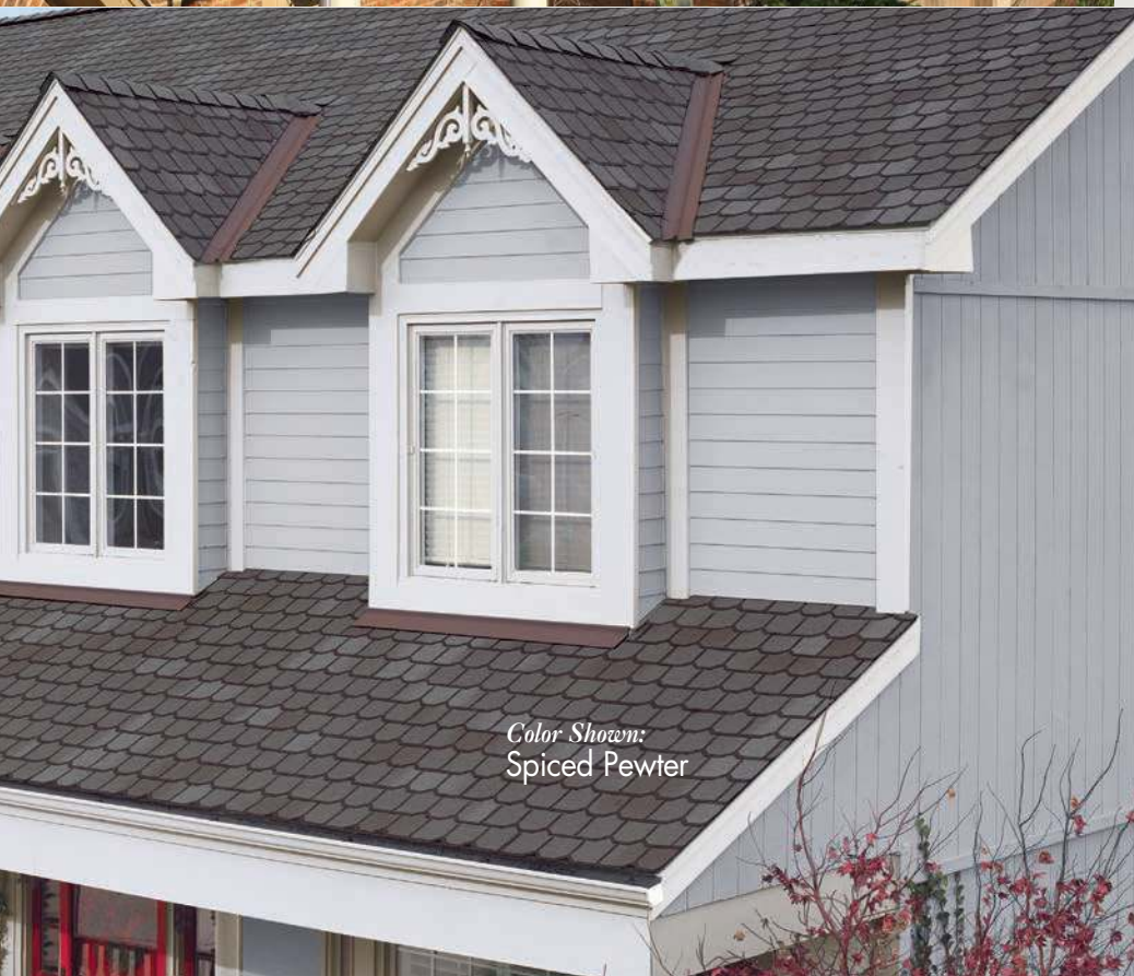
Color Shown: Spiced Pewter